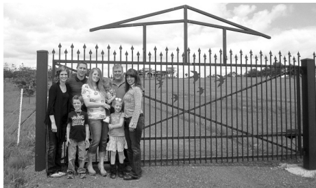
The Oberlander family by the McPhails' residence in Medford that was featured on ABC's Extreme Home Makeover program. Pro Weld also designed and installed the new security gates.

Pro Weld provides high quality architectural and structural steel work and fabrication on projects of all dimensions. Examples of their projects include stair-